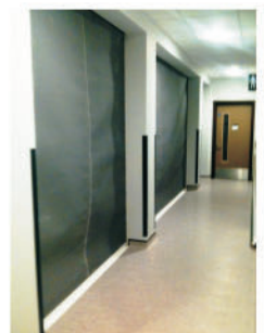
Multiple Curtain at Office