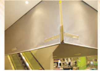
Static Curtains at Staircase

These curtains are made of light weight woven glass cloth which is coated to prevent the migration of fiber between areas. This makes it ideal for fire stopping in food processing unit, pharmaceutical companies and computer centers where dust is particularly undesirable.